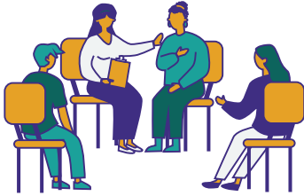
Group sessions that enable comradery and support amongst participants

The Los Angeles County Justice Care and Opportunities Department has implemented a Credible Messenger Program, YO! (Youth Overcoming), that uses a transformative mentorship curriculum for Transitional Age Youths between the ages of 18-26. The services consist of the following six components: