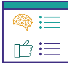
A curriculum based on cognitive behavioral principles