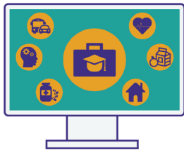
Case management and service navigation