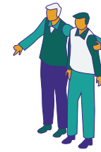
Case managers with lived experience of incarceration who are available for support, advice, and guidance