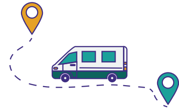
Transportation from and to court appointments